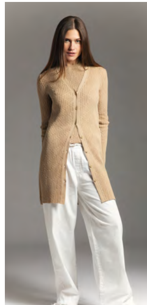
B60C41 CD304 + B60C44 CD304