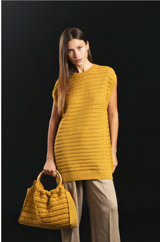
B60B50 COM7 + B60B54 COM7