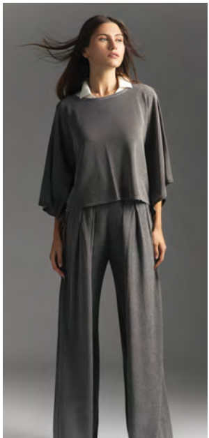
B6RC13 VID0 + B6RC10 VICD0