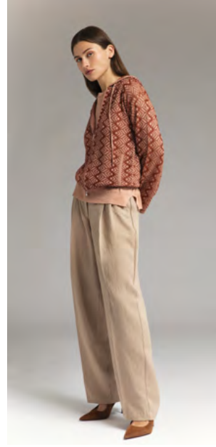
B6RB62 VICD06 + B20B80 KA204