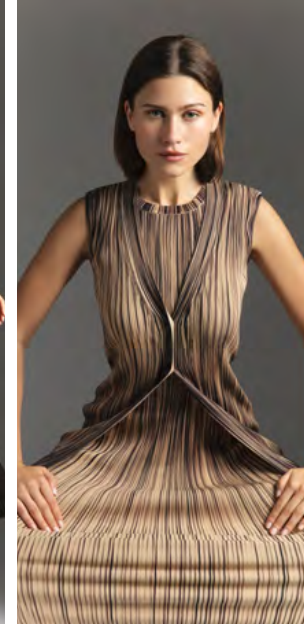
B6AC03 CD300 + B60C60LB003