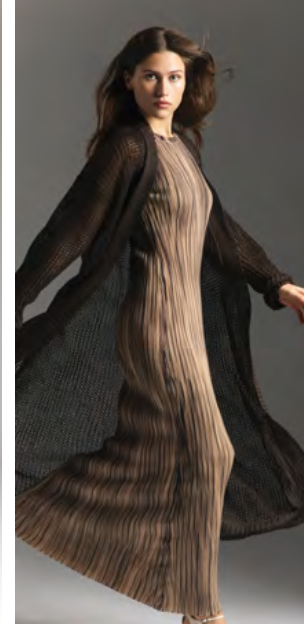
B6AC03 CD300 + B6C02 CD300