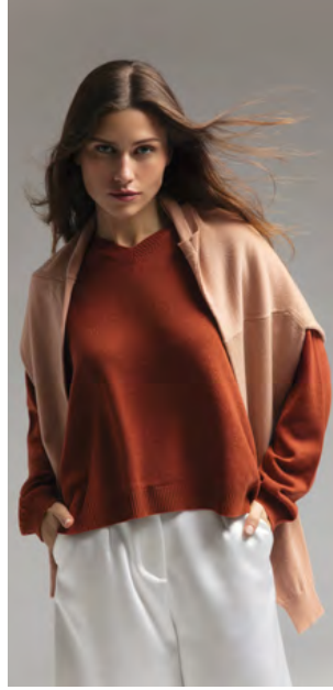
B20B21 KA204 + B20B80 KA204