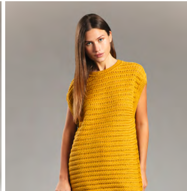
B60B50 COM7 + B60B54 COM7